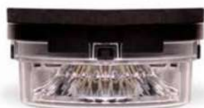
Under Mirror Light

9 LED, Single Colour 18 LED, Dual Colours 18 LED, Tri Colours